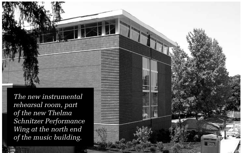
The new instrumental rehearsal room, part of the new Thelma Schnitzer Performance Wing at the north end of the music building.